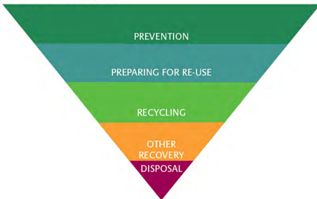
Figure 2: Waste Hierarchy

3.124. Given the pressing urgency of climate change and the need to embed the principles of the circular economy into all areas of our society, we encourage developers to consider including community spaces that help reduce waste and build community cohesion through assets such as community fridges, space for sharing, refill stations, and space for local food growing etc.