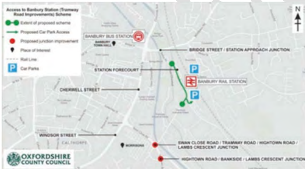
Banbury Tramway Road Improvements