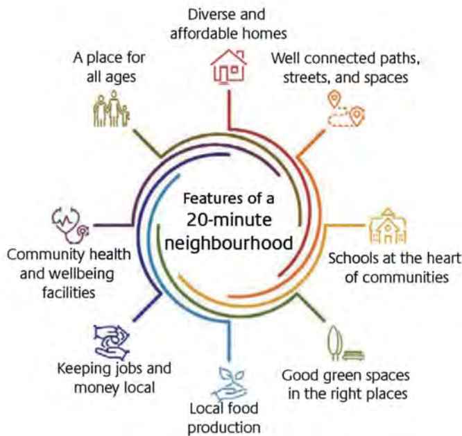
Figure 4: 20 Minute Neighbourhoods