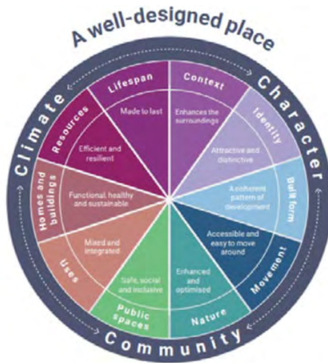
Figure 3: The ten characteristics of well-designed places (National Design Guide)

3.312. Masterplans are an important tool used by designers to set out the strategy for a new development and to demonstrate that the general layout, scale and other aspects of the design are based on good urban design principles. The Cherwell Residential Design Guide SPD sets out the principles of good design that must be demonstrated through the preparation of a masterplan as part of applications for major development and development of allocated sites. These, and other masterplans, should be produced in partnership with Cherwell District Council, the community and other stakeholders. For smaller developments, proposals need only be supported by a design and access statement which should provide a detailed design assessment proportionate to the scheme proposed.